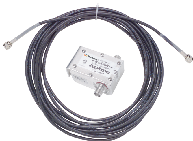
Lightning Arrestor Kit (shown with 25' cable)