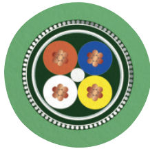
PROFINET drag chain CAT5e [93C]